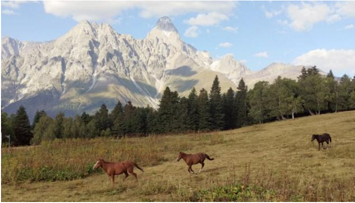
Horses Frolicking Near Mt. Ushba